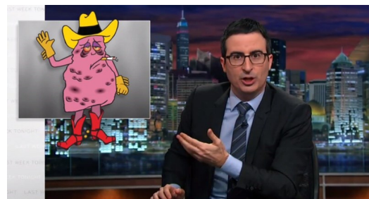
John Oliver cited ITC Uruguay Project data in a segment on HBO's 'Last Week Tonight' in February 2015.

International filed an international complaint before the ICSID over Uruguay's move to increase the size of warning labels on tobacco packaging and to restrict each brand to just one variant in 2010. ITC researchers and findings were critical to the government of Uruguay's victory over PMI, including evidence from the ITC Uruguay Survey demonstrating that the proposed increase in the size of the warnings from 50% of the pack to 80% of the pack led to significant increases in effectiveness, directly refuting PMI's claim. Read more about the legal battle, and the full ICSID verdict at: http://www.theunion.org/news-centre/news/For-an-globally-significant-legal-victory-for-public-health-philip-morris-international-v-uruguay . For an in-depth analysis of the ICSID's decision visit: http://www.mccabecentre.org/downloads/Knowledge_Hub/McCabe_Centre_paper_on_Uruguay_award.pdf .