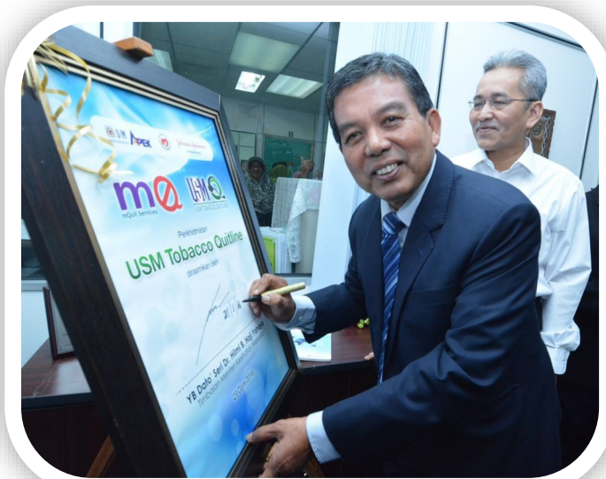
Dato' Seri Dr. Hilmi bin Haji Yahaya, Deputy Health Minister, launched the MQuit-USM Tobacco Quitline on August 29, 2016 at USM, Penang, Malaysia.

wish to quit following the implementation of national tobacco control policies such as increasing tax and price of cigarettes, pictorial health warnings on cigarette packages, anti-smoking educational Tak Nak (Say No) media campaigns, and smoke-free workplaces and public places. USM media coverage (in Malay—with English subtitles available) of the Quitline launch can be viewed here: https://youtu.be/HxrhVqlgtv0 .